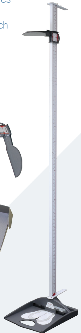
Vertical measurement mode (patient standing)

Specifications may change without notice