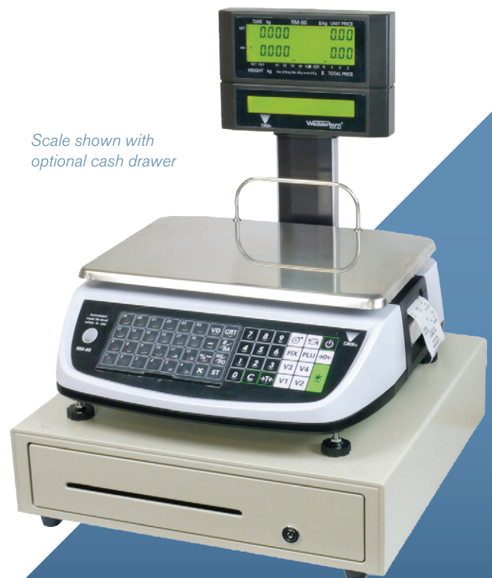
Scale shown with optional cash drawer